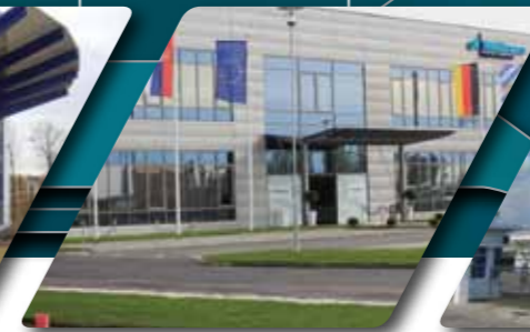
STARA PAZOVA, SERBIA