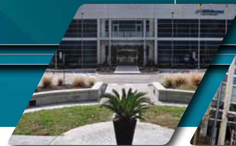
NEWPORT NEWS, USA